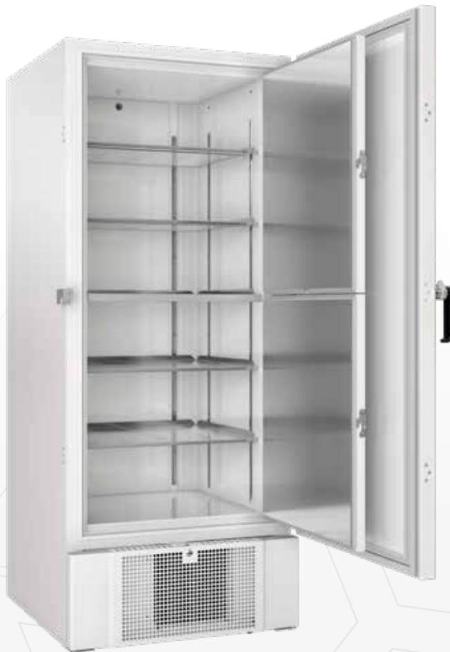
BioUltra UL570 comes with 5 perforated stainless steel shelves.

The BioUltra UL570 is an ultra low temperature freezer that operates safely at -86\text{ }^{\circ}\text{C} . Utilising high-capacity components, cascade refrigeration system, latest generation VIP-technology and insulated inner doors, the BioUltra is able to maintain safe and stable interior conditions when operating at -86\text{ }^{\circ}\text{C} .