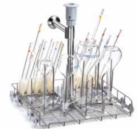
LPM2020DS Mixed injection carrier for washing and drying of flasks and pipettes