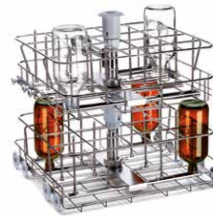
LB32DS Bottle washing and drying carrier