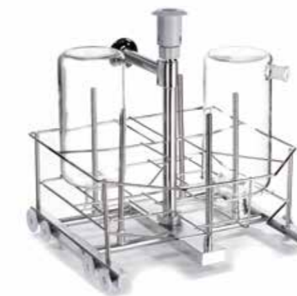
LBT5DS Trolley for bottles with drying system