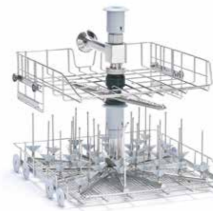
LM40ICS1DS Universal multifunctional trolleys with two washing levels