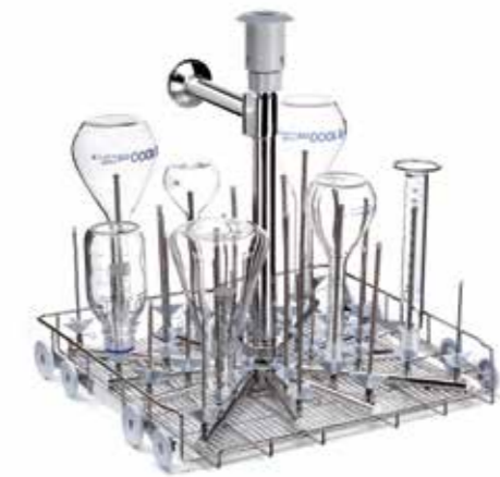
LM40DS Universal narrownecked glassware washing and drying carrier